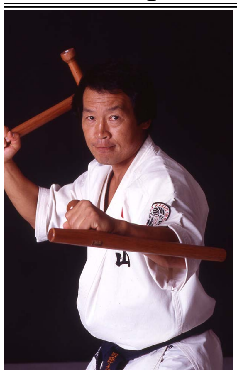
Founder Saiko Shihan Y. Oyama

I will begin by reminding you of what it means to be a Black Belt. The Black Belt is the symbol of power in the martial arts world, and anyone who wears it represents the organization. I told you this in newsletter issue #3 in 2004. Now I will show you the deeper meaning of Black Belt and what it takes to get there.