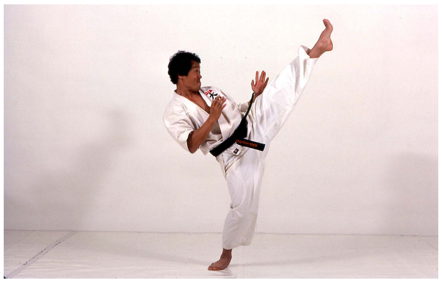
Saiko Shihan's Jodan Mae Geri

technology. Much of it is good. But, altogether, it is bad for us in many ways. In my opinion, everybody used to have much more patience. People used to wait for results or for an answer. Today, they can't wait one second! If they can't get what they want almost instantly, they move on to something else. That's crazy. I'm a professional Karate instructor. I teach my students. Of course I am also a businessman, and like anyone else, I want to build up my business. But there is one thing that I cannot change. I cannot change the essence of Karate. If I try to change it, then it is no longer Karate. I started observing about 10 years ago that Karate teachers in some styles were operating their schools just like a fast food chain. They started turning out Black Belts so fast it looked like the drive through at Burger King! They say that they just teach the students everything they need to know in a short period of time. This may be possible for a very few students - those that start their training in great physical condition and who are very well coordinated. But the great majority of students are not, and so this is physically impossible.